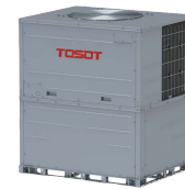
34,000 BTU/hr Condensing Unit