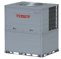
56,000 BTU/hr Condensing Unit